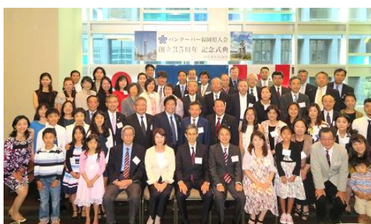
【Commemorative Ceremony in Vancouver】